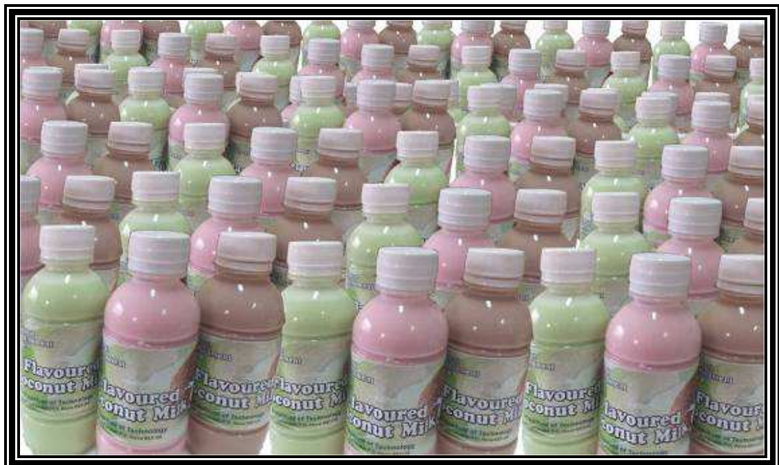
Figure 1: Flavoured coconut milk from CIT