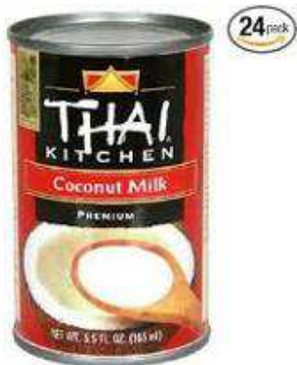
Figure 16: Thai Kitchen, California