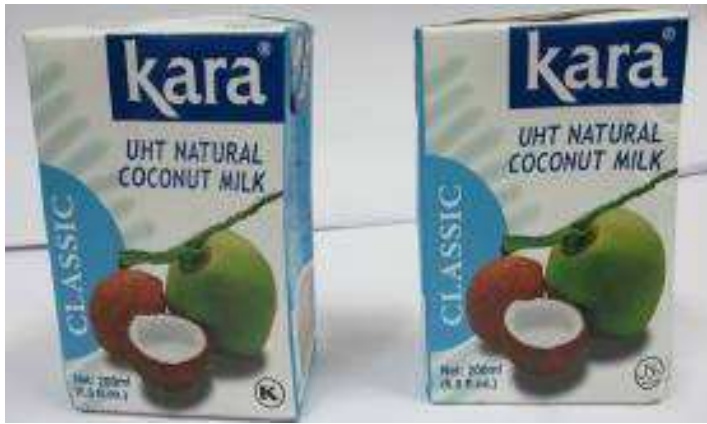
Figure 12: Kara, Singapore