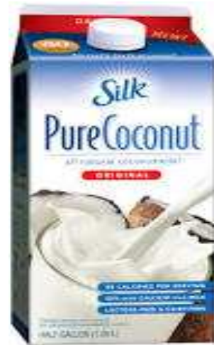
Figure 13: Silk, Colorado, US