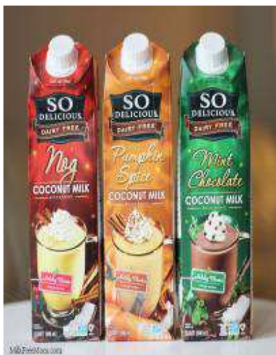
Figure 10: So Delicious,US