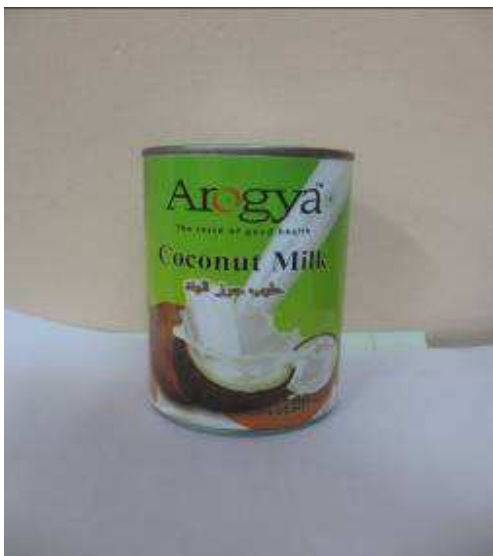
Figure 4: Holista Transworld Ltd, Chennai