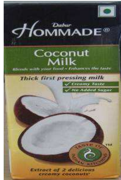
Figure 3: Dabur, UP