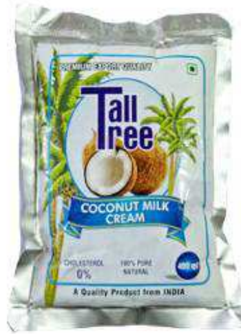
Figure 7: Sakthi Coir Products, Pollachi