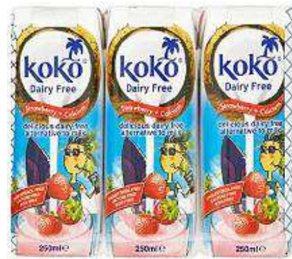
Figure 15: Koko, UK