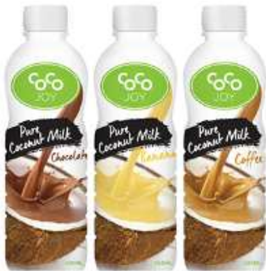
Figure 14: Coco joy, Australia