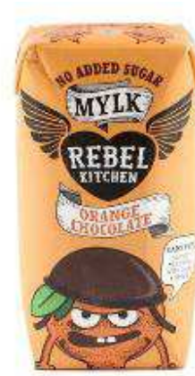
Figure 18: Native forest, California Figure 19: IBERIA, Thailand Figure 20: Rebel Kitchen, UK