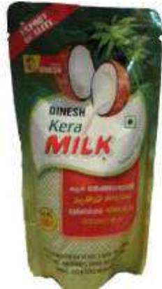
Figure 6: Dinesh Foods, Kannur