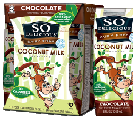
Figure 11: So Delicious,US