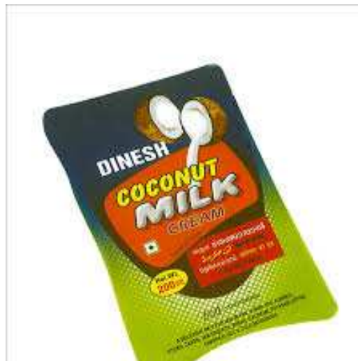
Figure 5: Dinesh Foods, Kannur