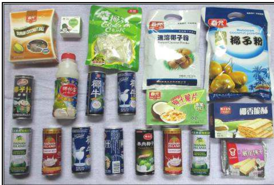
Figure 8: Coconut products manufactured in China