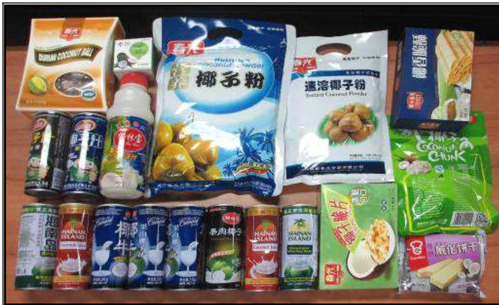
Figure 9: Coconut products manufactured in China