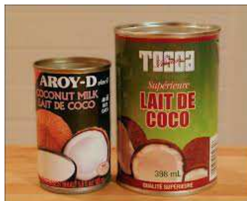
Figure 17 : Aroy-D, TOSCA, UK