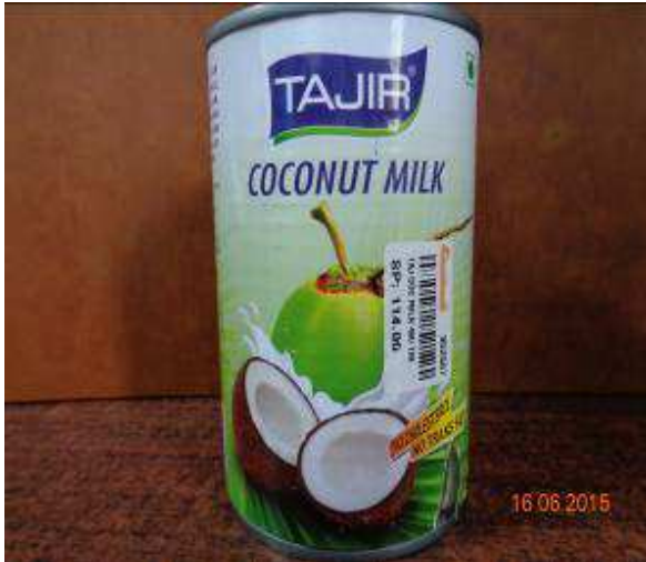
Figure 2 : Tajr Pvt Ltd, Mumbai