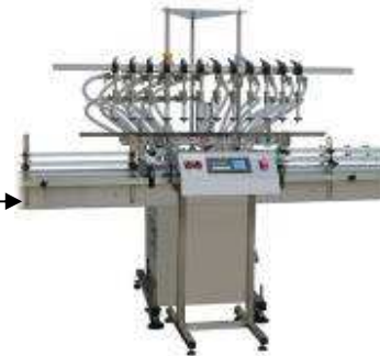
Filling and bottling